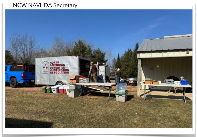
"Spring Cleaning" - Perfect weather to clean out our NAVHDA Trailers last weekend!